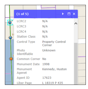
Property controlling corners