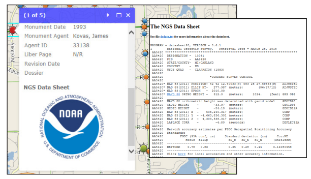
National Geodetic Survey (NGS) control, with links to the NGS data sheets