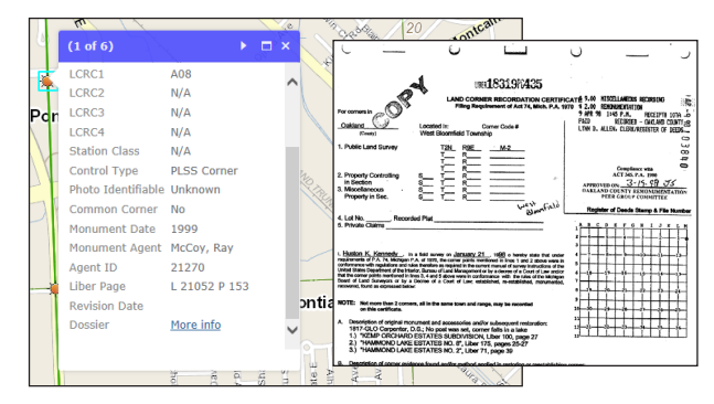
Section corners, with dossiers for peer-approved, remonumented corners

Oakland County has a way for you to save both time and money. View surveyor-specific information, including: