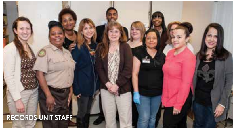
RECORDS UNIT STAFF

The Records Unit is an efficient, customer service-oriented entity that performs the processing and retention of all of the OCSO's incident reports, traffic accident reports, tickets, inmate folders, and purchase permits. Responsible for the editing, data-entry, retrieval and forwarding of information and statistics from these files, the Records Unit manages tens of thousands of records. Other functions of the Records Unit include sex offender registrations, gun registrations, concealed weapons applicant fingerprinting and background checks, pawn entries, freedom-of-information-requests, inmate identity transfer corrections, non-public records entries, and various government agency and citizen requests for reports, background checks, and incarceration information.